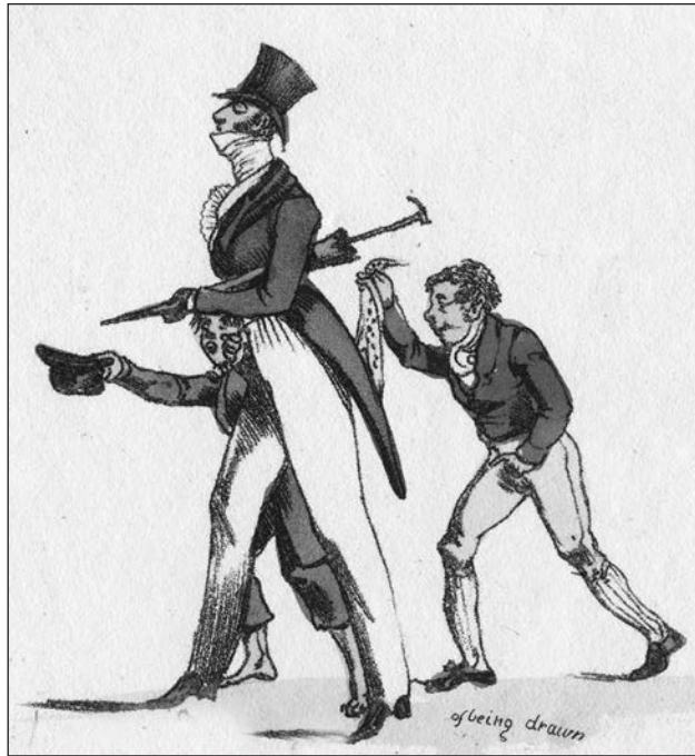
[Criminal activity in the 19th century]

Use Sources A, B and C to identify one similarity and one difference in criminal activity over time. [4]