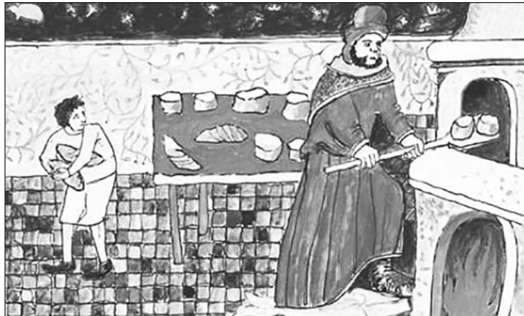
[Criminal activity in the medieval period]